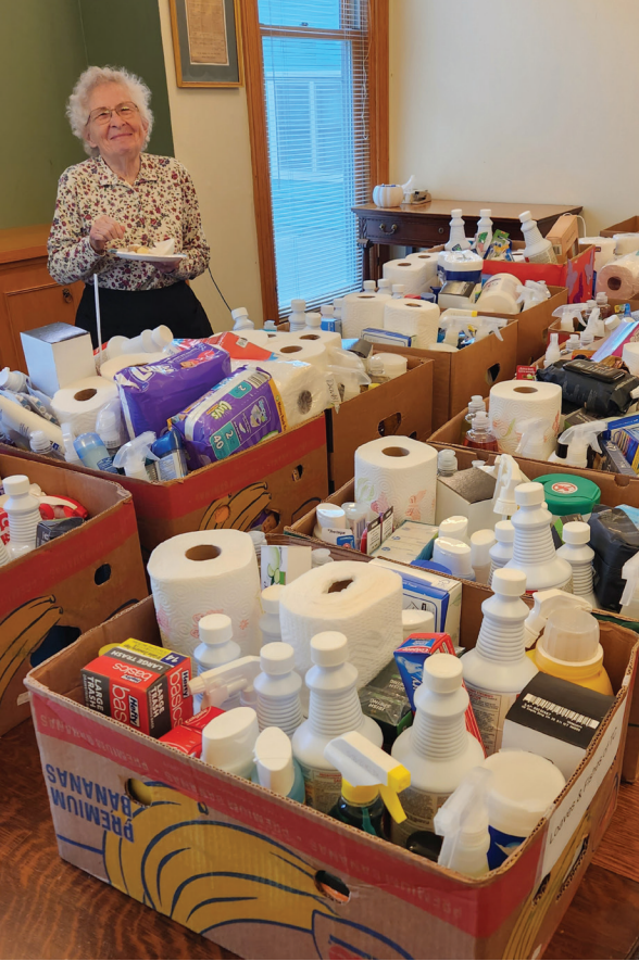
$3,000 plus donated goods for Tompkins County Food Pantries

As has been tradition for many years, each fall UWTC hosts a food pantry drive with a focus on items that cannot be secured through other food networks. The week culminated on Friday's Stephen E. Garner Day of Caring with UWTC presenting $3,000 and the re-distribution of donated goods to fourteen food pantries throughout Tompkins County. The funds allowed the pantries to purchase food in addition to receiving the hygiene and cleaning items collected. Community members and several workplaces in Tompkins County joined together for this annual drive in Fall 2022, including CFCU Community Credit Union, Cornell University, and M & T Bank.