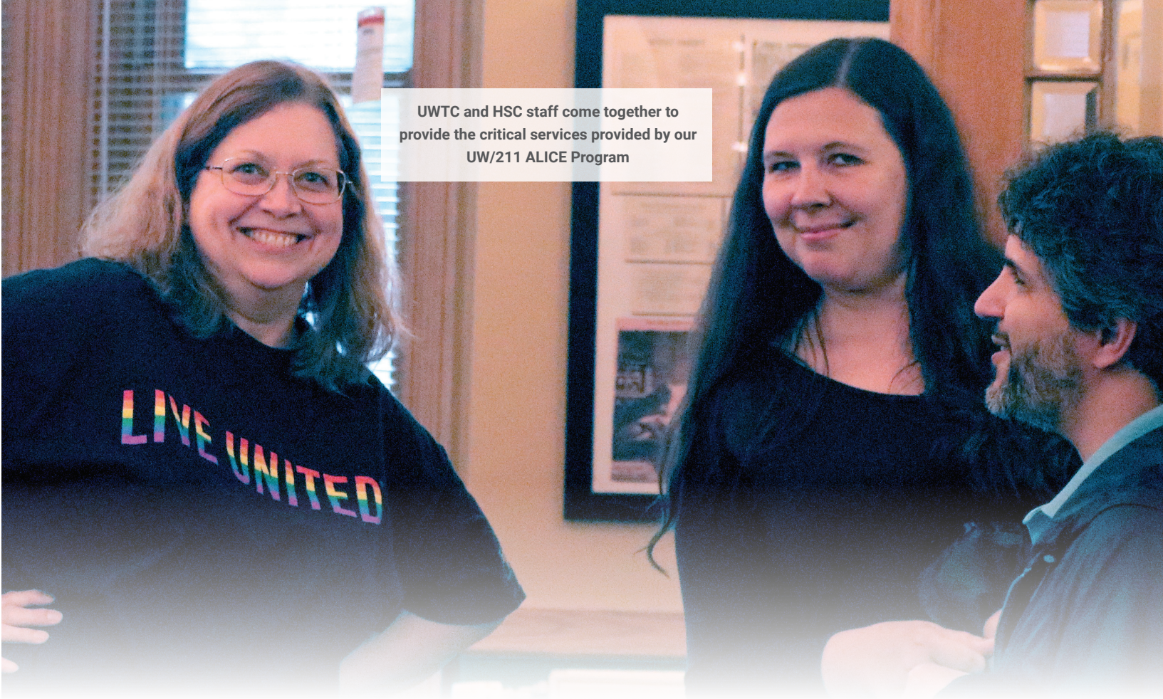
UWTC and HSC staff come together to provide the critical services provided by our UW/211 ALICE Program

In a new collaboration with Human Services Coalition, a long-time impact partner, UWTC invested gifts designated by donors to diversity, equity & inclusion with the BLOC Capacity Building Program. The funds were made available for the leaders completing the program to engage in capacity-building projects with their organizations.