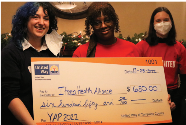
YAP students present a grant award to Ithaca Health Alliance